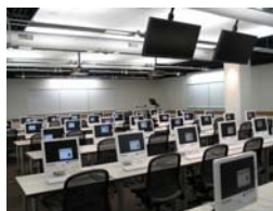
Both Mac and PC computer labs are available for scheduling. There are over 300 programs on the lab computers.

Each room has one Mac and one PC at the podium for instructor use. The computer labs will also feature large numbers of either Macs or PCs, which feature over 300 software applications and utilities. All computer systems are able to play audio CDs, DVDs, and can use a variety of multimedia storage devices. The computers use the UNID system for authentication, so classes for non-U of U students will need to make arrangements with the Knowledge Commons staff prior to their class. Additional software can be installed upon request.