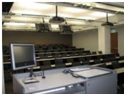
The new Level 1 classrooms have state of the art podiums, dual projectors and screens, plus flat panel screens for viewing by students in the back rows.

The Knowledge Commons at the Marriott Library is responsible for scheduling and maintaining a large number of classrooms